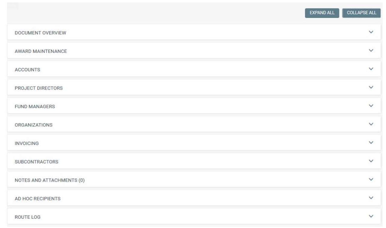
Figure 3 – Award e-doc

The Award document includes its own unique tabs: Award Maintenance, Accounts, Project Directors, Organizations, and Subcontractors, in addition to the standard tabs.