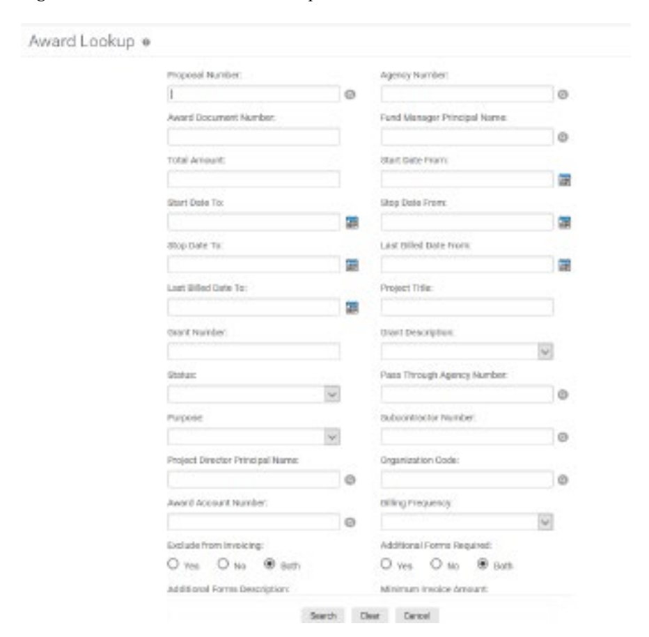
Figure 2 – Award Lookup (A tutorial that demonstrates "Lookup" functionality is available.)

Award lookup allows you to search for information in KFS pertaining to the award. The Proposal number is the Award number and is also the OSP number. The Award e-doc (Document Type AWRD) is systematically created and updated from the system of record, RASS. The proposal is created in KFS only to support the Kuali business rules. The proposal record is not generally referenced in KFS.